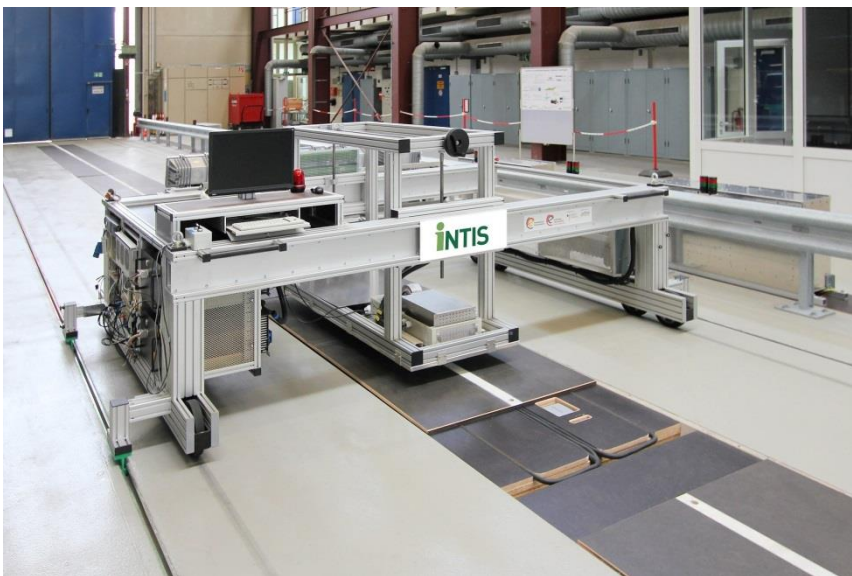
Figure 3 - Test frame for inductive components

A specially designed test frame is available for examining the vehicle side of the system. Vehicle side inductive coils (pick-ups), downstream power electronics, positioning and communications technology can all be installed on the test frame. A testing vehicle is also available for verification of systems in a real-world on-vehicle environment.