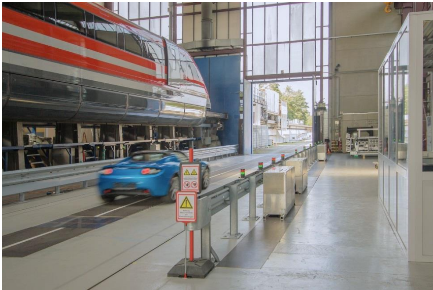
Figure 1 - Dynamic charging on the move

INTIS is a specialist in the development of innovative solutions for private and industrial applications and its test centre is available to INTIS' customers to examine their components and systems as well as technologies specially developed by INTIS as a development partner.